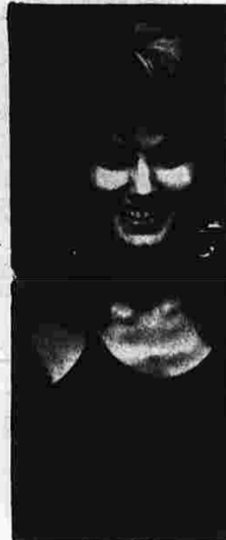
Paula Prentiss in "He & She"