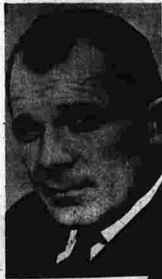
F. Lee Bailey